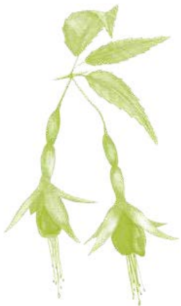
Chilco - Fuchsia magellanica