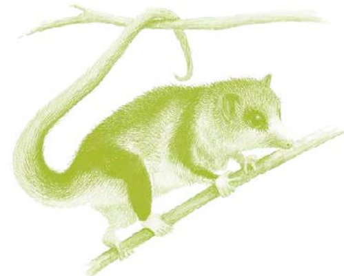
Monito del Monte - Dromiciops gliroides

Weekend contact / Emergency contact: +56 9 447 26646